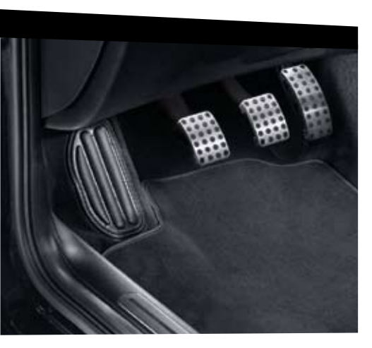
Aluminium sports pedals and kick plate