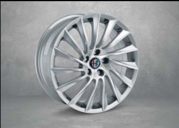
435 18" Turbine design alloy wheels (with 225/40 R18 tyres)