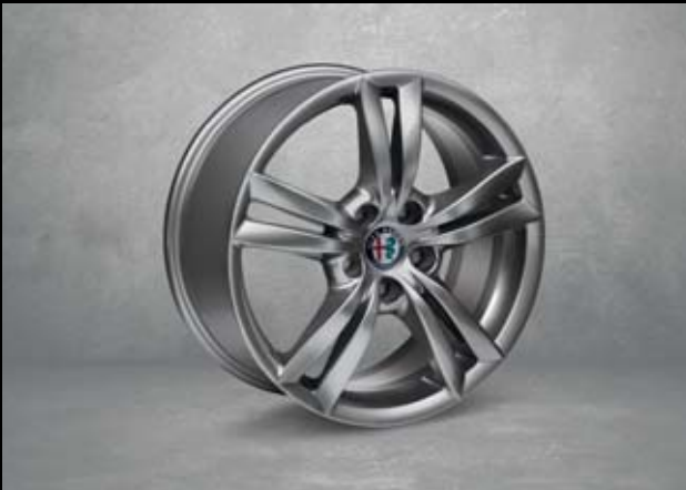
421 17" Burnished 5-double spoke design alloy wheels (with 225/45 R17 tyres)