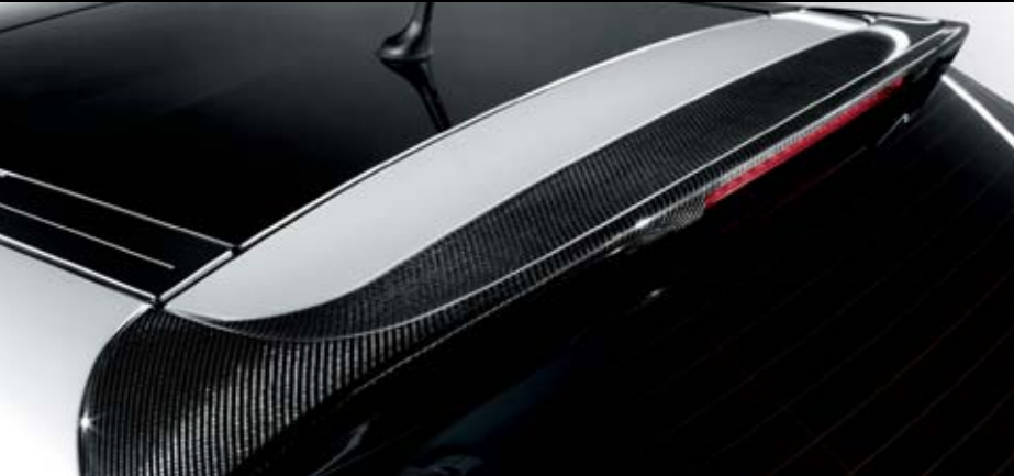
Rear carbon spoiler