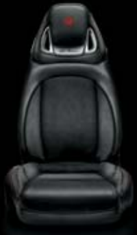
Leather & Alcantara® sports seats with integrated headrest 323 Black with red stitching (Optional)