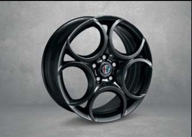
5FB 18" 5-Hole design alloy wheels with dark finish (with 225/40 R18 tyres)