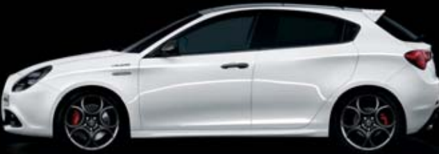
217 Alfa White