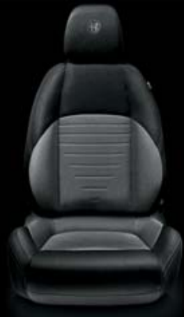
Giulietta cloth 198 Black/Antracite (Standard)