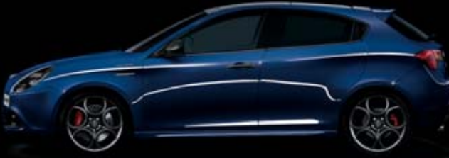
486 Cobalto Blue