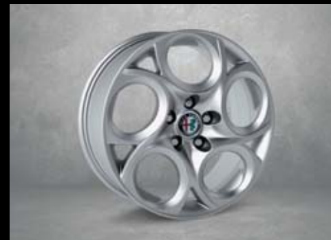
5YN 17" 5-hole design alloy wheels (with 225/45 R17 tyres)