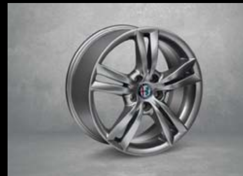
421 17" Burnished 5-double spoke alloy wheels (with 225/45 R17 tyres)