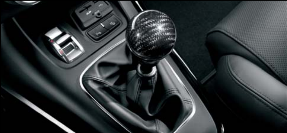
Carbon gear knob

The mission of Mopar® is to ensure customers of all brands within Fiat Chrysler Automobiles receive a satisfying ownership experience for the vehicle's entire life cycle, putting their after-sales service leadership and know-how at their service. Mopar® looks after cars from the moment they leave the dealership onwards, guaranteeing the customer the very highest level of service, employing cutting-edge technology and innovative, original and high-quality products.