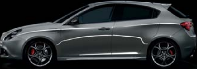
318 Stromboli Grey