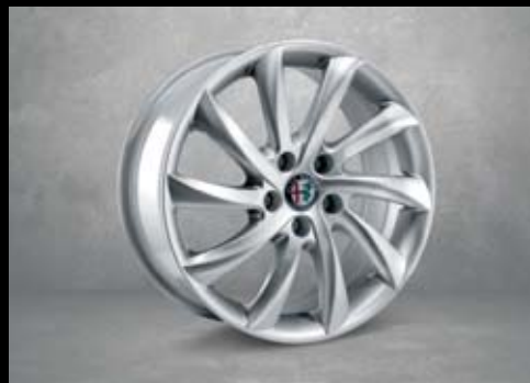
420 17" Turbine design alloy wheels (with 225/45 R17 tyres)