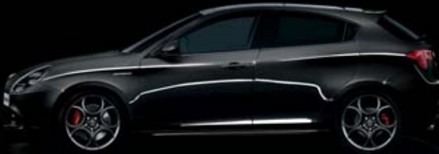
601 Alfa Black