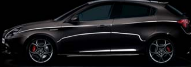
805 Etna Black