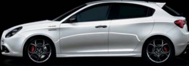
764 Luna Pearl