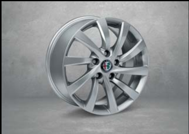
431 16" Turbine design alloy wheels (with 205/55 R16 tyres)