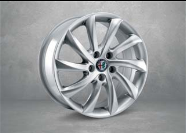
420 17" Turbine design alloy wheels (with 225/45 R17 tyres)