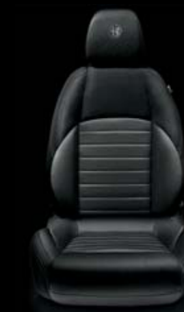
Competizione fabric 123 Black (Standard)