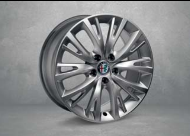
74B 17" Multi spoke alloy wheels (with 225/45R17 tyres)