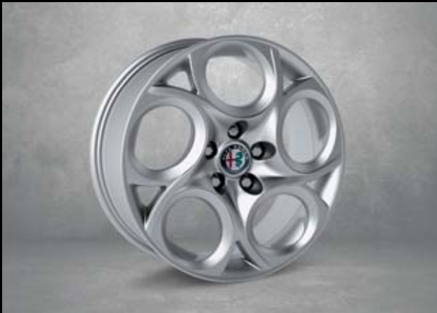
5YN 17" 5-hole design alloy wheels (with 225/45 R17 tyres)