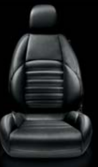
Leather 923 Black (Optional)