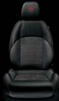
Fabric & Alcantara® sports seats 308 Black with red stitching (Standard)