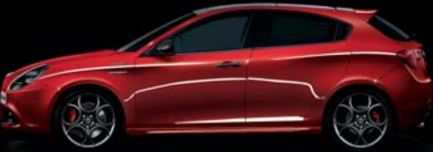
361 Competizione Red