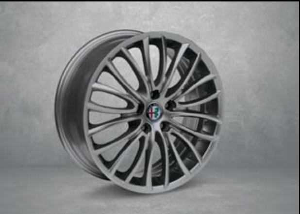
73Z 18" Burnished Multi-spoke alloy wheels (with 225/40 R18 tyres)