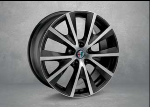
7HP 18" Dual 5-spoke alloy wheels with titanium finish (with 225/40 R18 tyres)