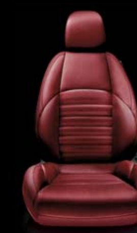
Leather 401 Red (Optional)