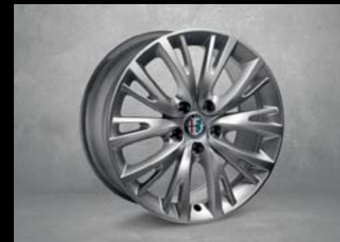
74B 17" Multi-spoke alloy wheels (with 225/45 R17 tyres)