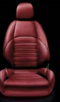
Leather 901 Red (Optional)