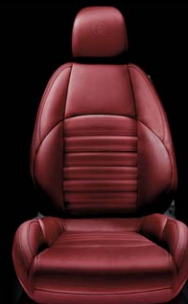
Leather 401 Red