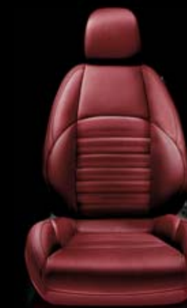
Leather 901 Red (Optional)

*Sports seats come with manual lumbar adjustment and no armrest