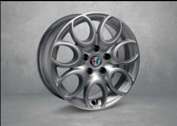
74A 16" 7-hole design alloy wheels (with 205/55 R16 tyres)