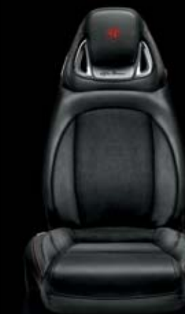
Leather and Alcantara® sports seats with integrated headrest 323 Black with red stitching (Standard)