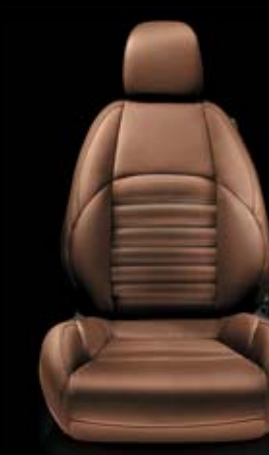
Leather 465 Tan (Optional)