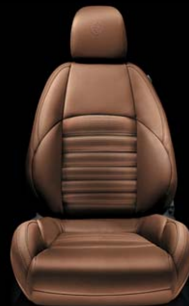
Leather 465 Tan