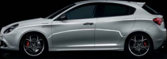
620 Silverstone Grey