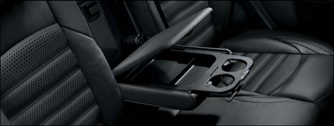
Rear armrest with storage compartment, shown with optional leather upholstery