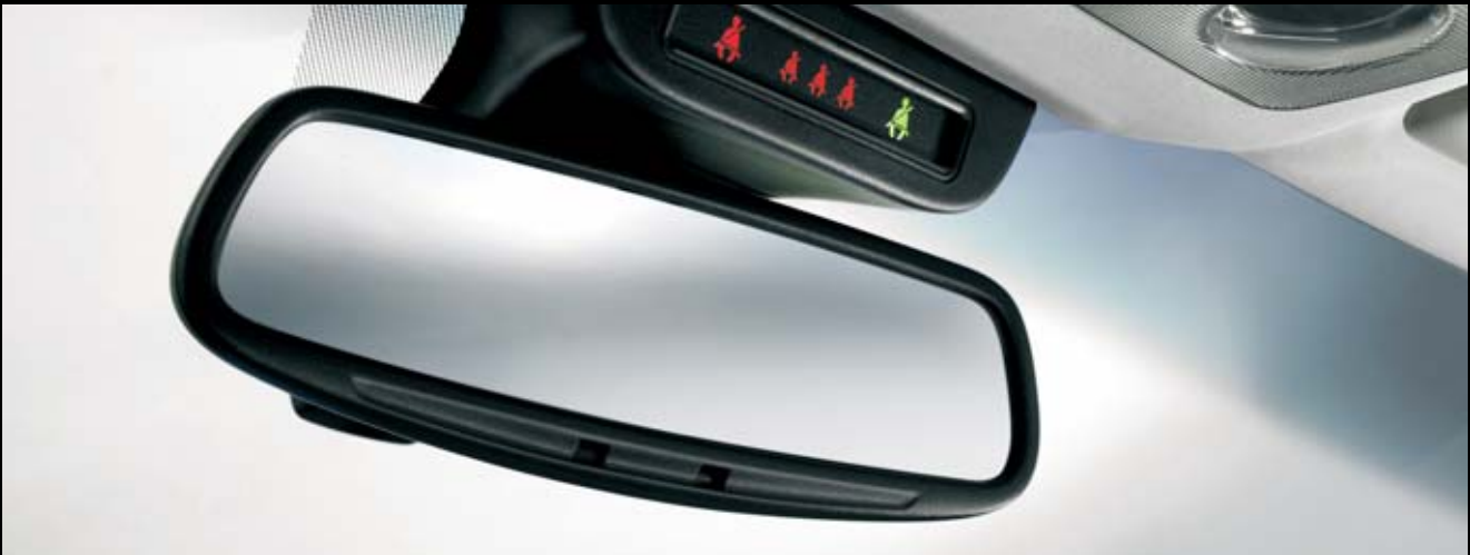
Electrochromic rear view mirror with deactivation button