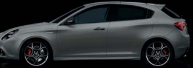
529 Matte Magnesio Grey