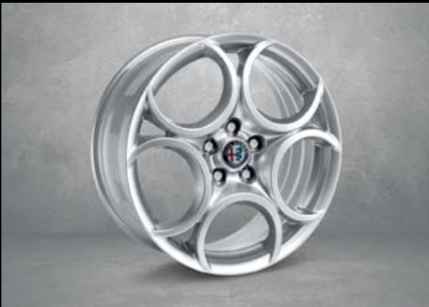
439 18" 5-hole design alloy wheels (with 225/40 R18 tyres)