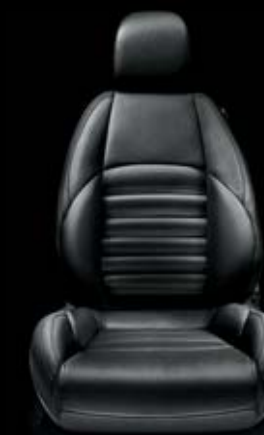
Leather 923 Black (Optional)