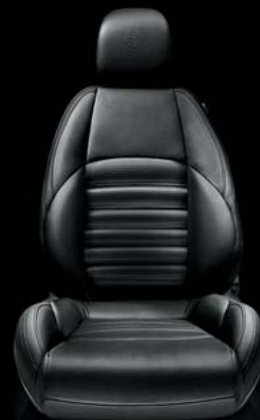
Leather 408 Black