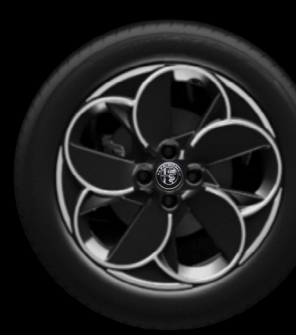
1M5 - 18" Petali alloy wheels diamond cut