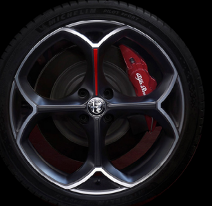
5RK - 20" Venti alloy wheels diamond cut