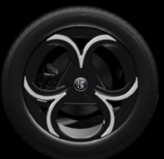
WP8 - 18" Fori alloy wheels