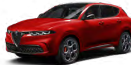
Alfa Red with Black Roof 956/C