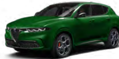
Montreal Green with Black Roof 041/B