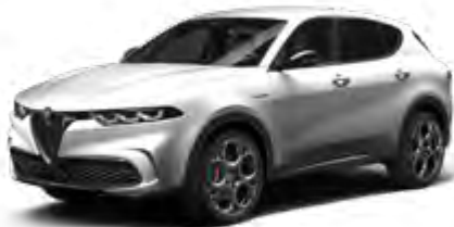
Banchise White 240/C