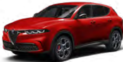
Alfa Red 414/C