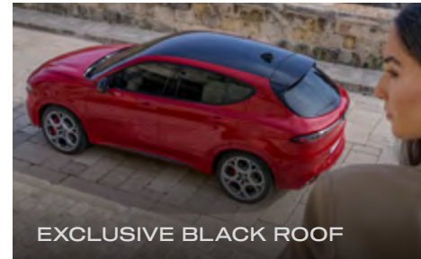
EXCLUSIVE BLACK ROOF