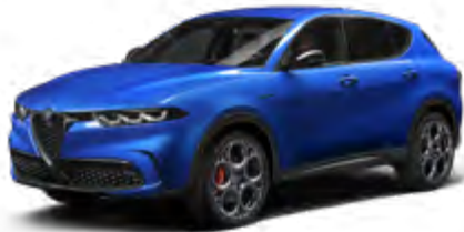
Misano Blue 756/A