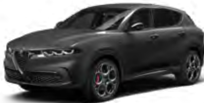
Vesuvio Grey 581