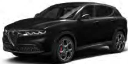
Alfa Black 601