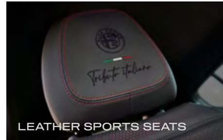
LEATHER SPORTS SEATS