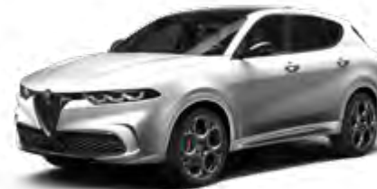
Banchise White with Black Roof 222/C