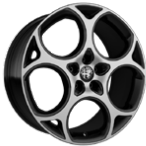
1MJ 19" Alloy wheel dark finish, diamond cut