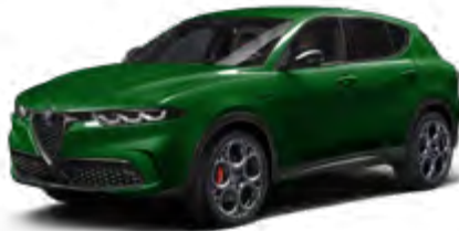
Montreal Green 398/D