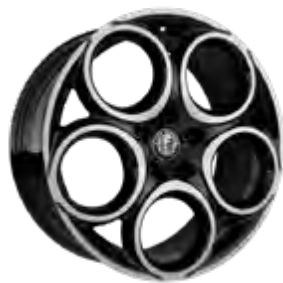
WFL 18" Alloy wheel dark finish, diamond cut