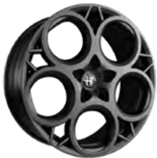
1M5 20" Alloy wheel grey finish