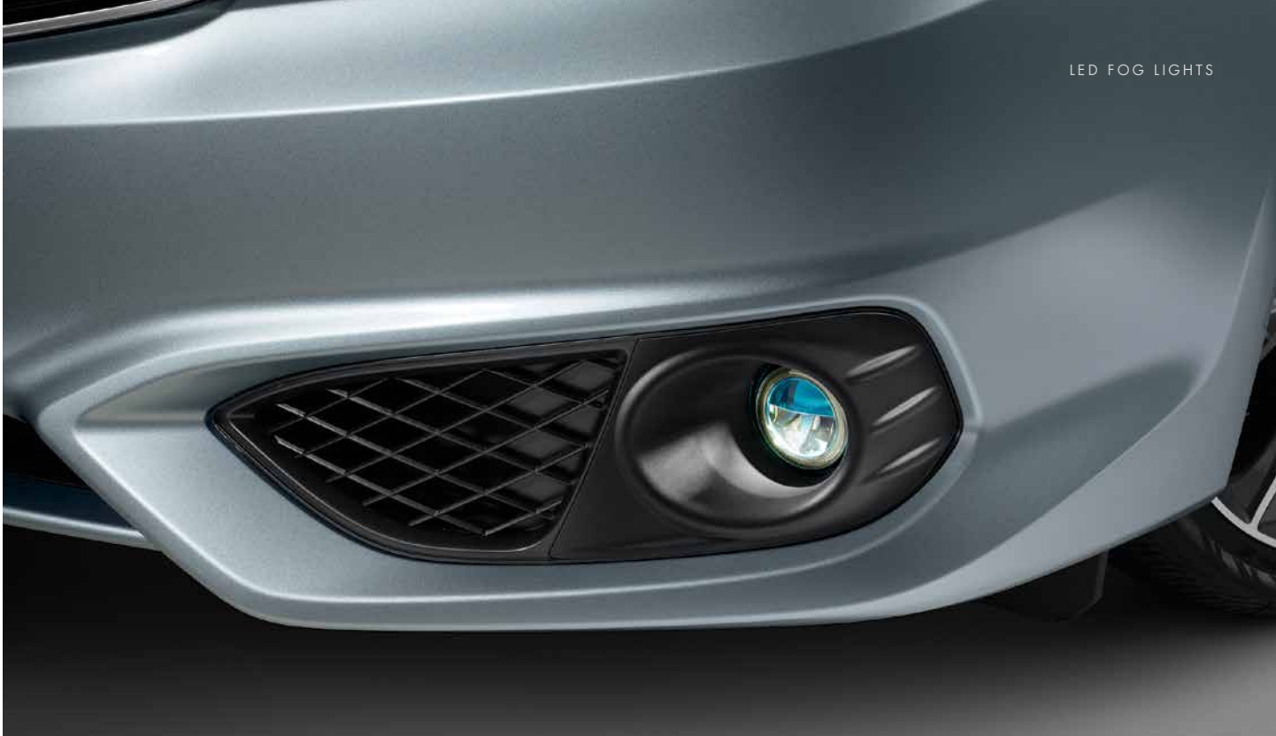
LED FOG LIGHTS