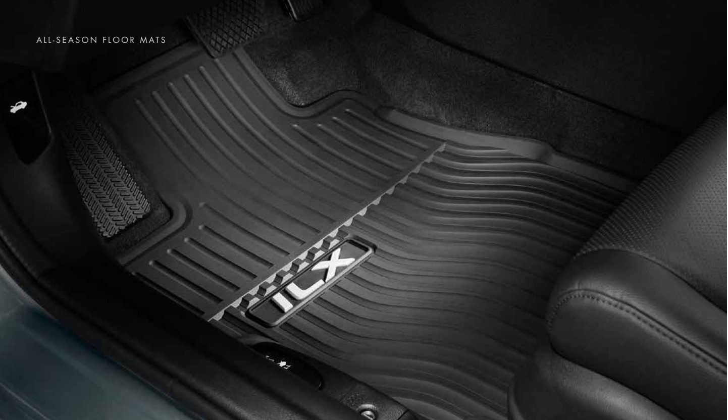
ALL-SEASON FLOOR MATS