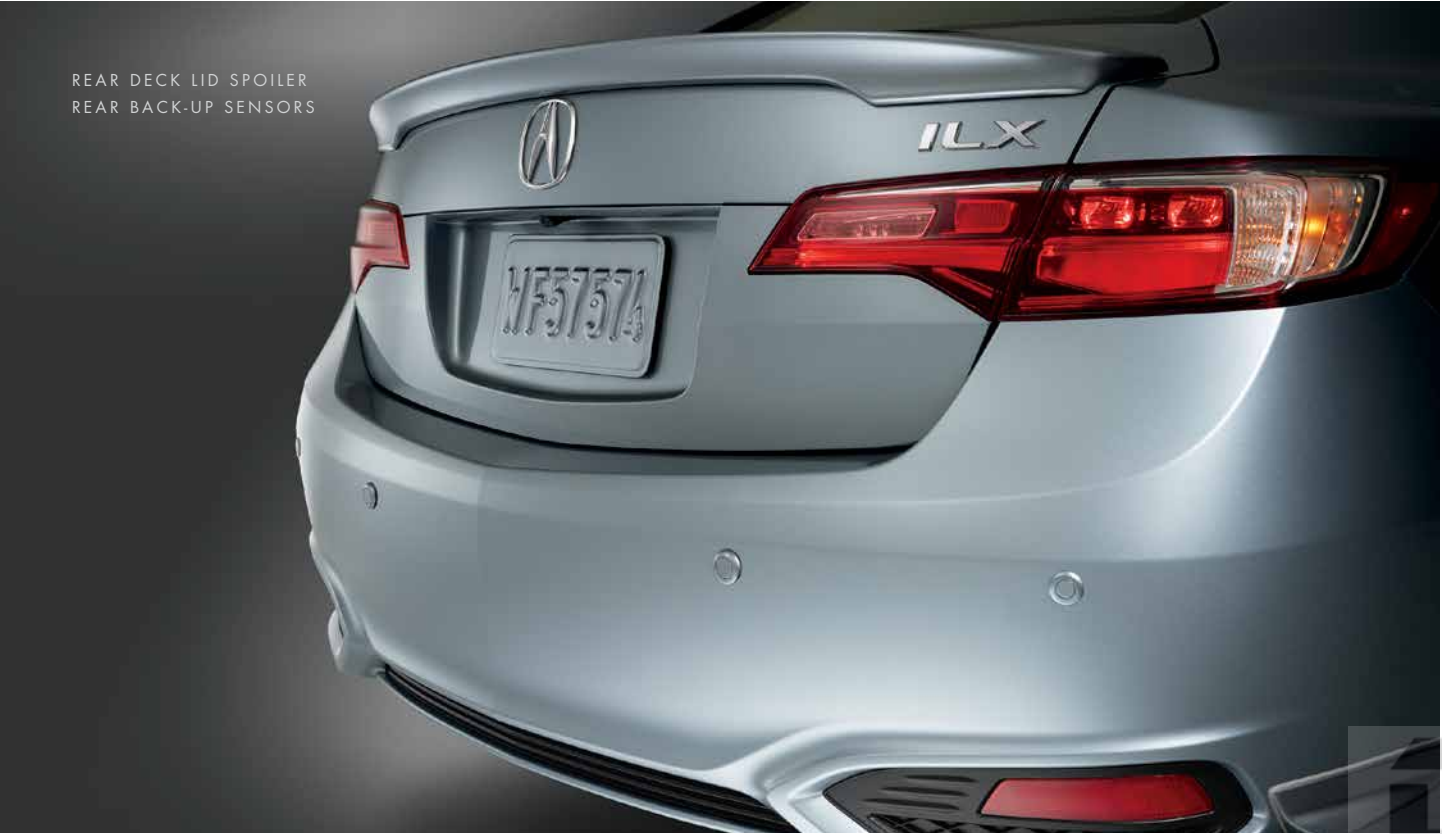
REAR DECK LID SPOILER REAR BACK-UP SENSORS